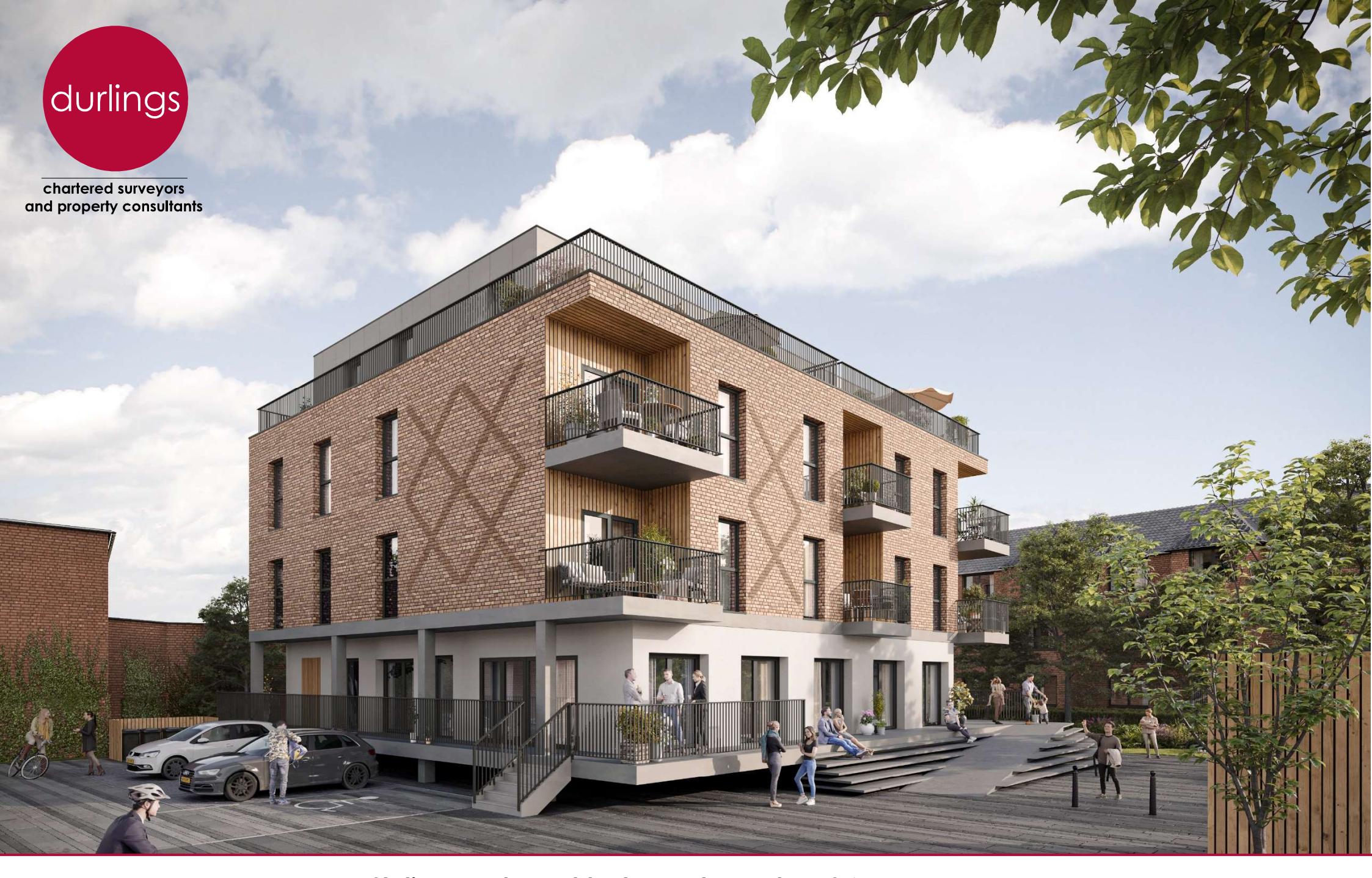
Station Road • Paddock Wood • Kent TN12 6AB